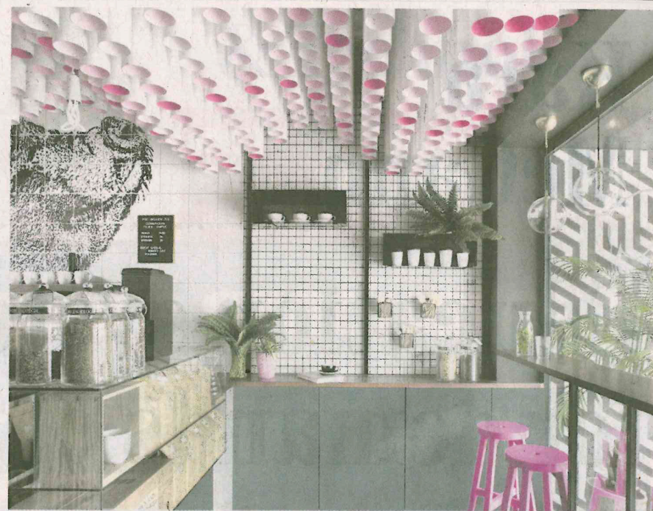
Above: Independent Café Pot Bellied Pig, Designed by KLD. Below: Render of Design for The Greenway — Iconic Offices (3D Design Bureau)